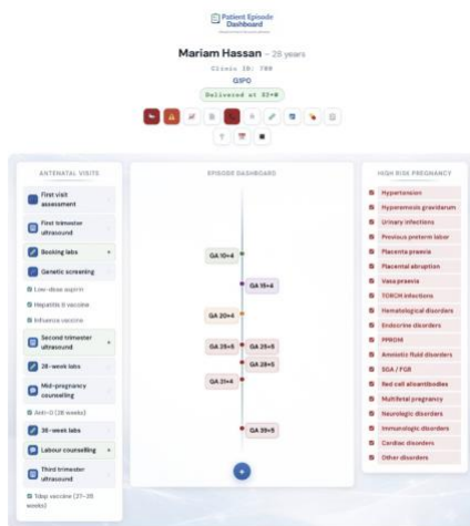
Episode Dashboard — timeline, tasks, and 19 high-risk modules